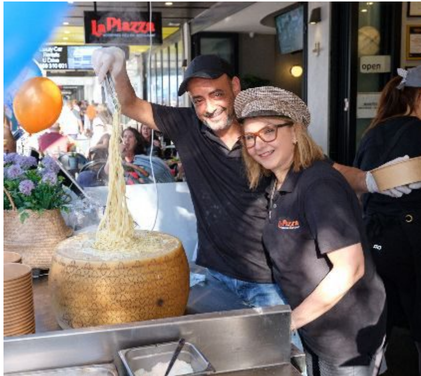
Caption: LaPiazza enjoyed extending their dining area during Streets Alive in May 2022