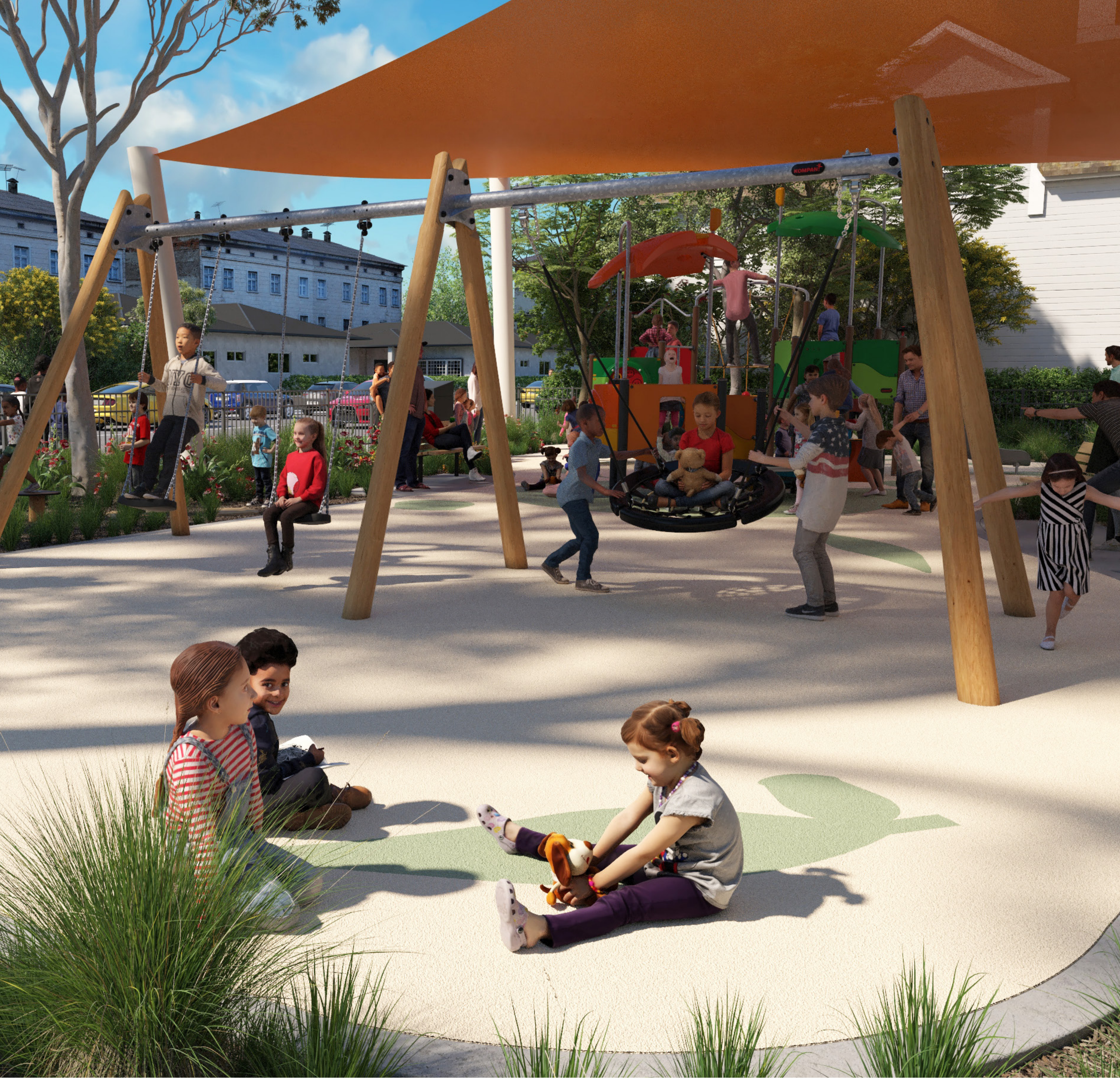
NDICATIVE ARTIST IMPRESSION