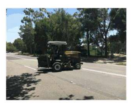
BDGC Submission to 152 Bunnerong Road, Eastgardens

Your support in this matter is greatly appreciated.