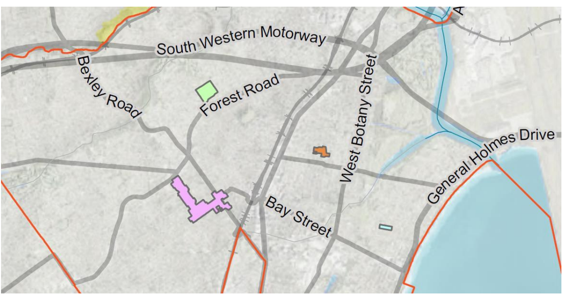
Figure 1: A contextual map outlining the locations of the proposed HCAs. (Bardwell Valley - green; Banksia - orange; Brighton Le Sands - blue; and Ocean View Estate, Bexley - purple)

Reference should be made to Attachment 3 for background information, draft statements of significance and other detailed material for the four proposed HCAs, as well as the two originally proposed HCAs from the 2019 report.