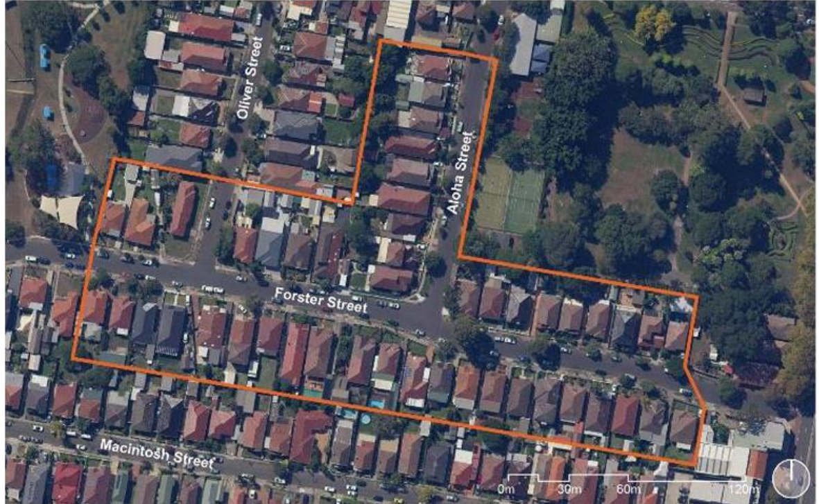
Figure 2: Location of the Aloha and Forster Streets, Mascot HCA original proposed boundary (Source: Six Maps with GML 2019 report overlay).

In their review of the original Mascot HCA proposal, the independent Heritage Consultant concluded: